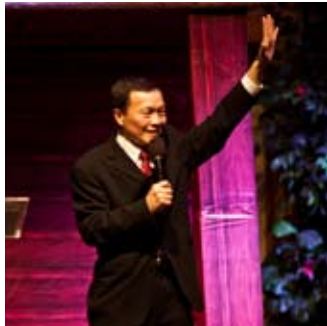
Welcome to our New Hope Family