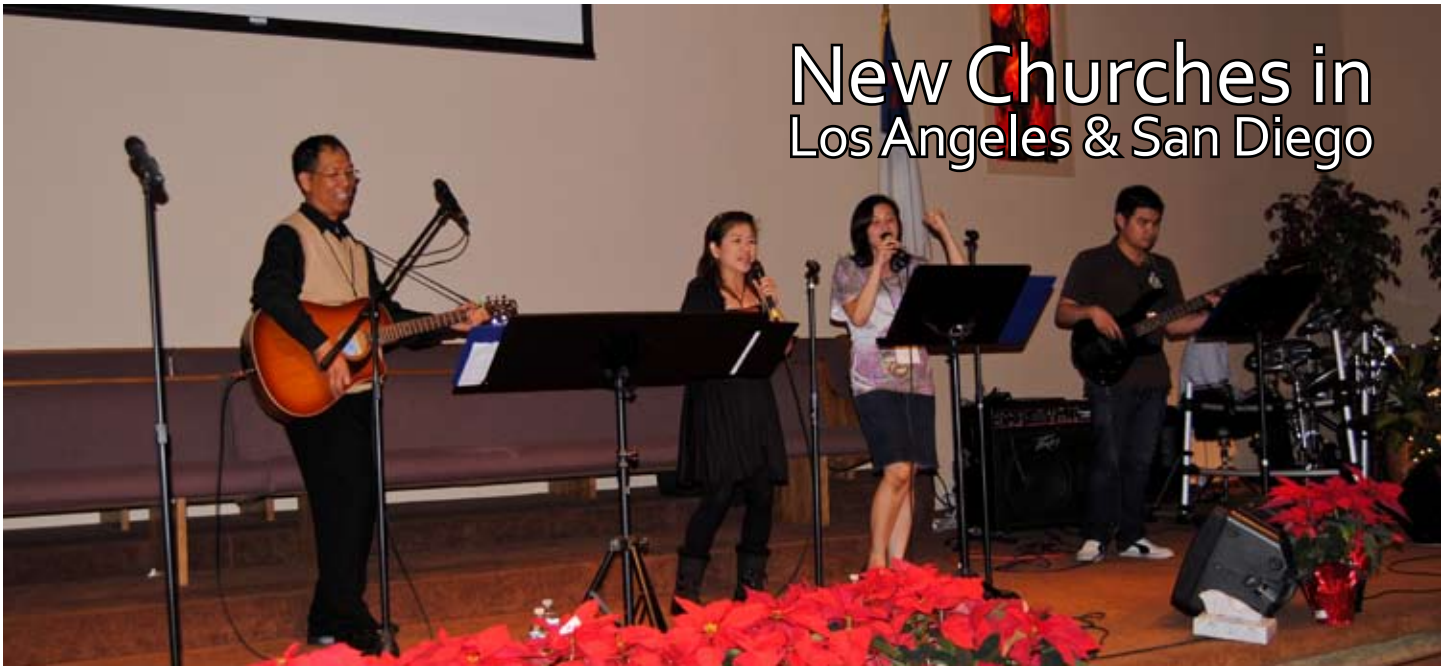
Revival Service in California