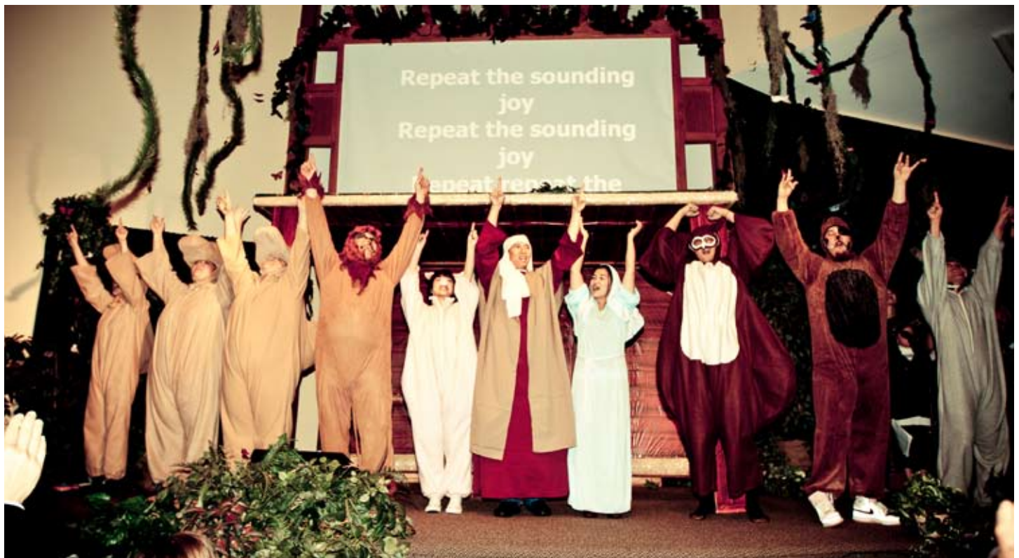
The cast of Christmas Animals