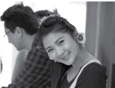
Welcome to our New Hope Family