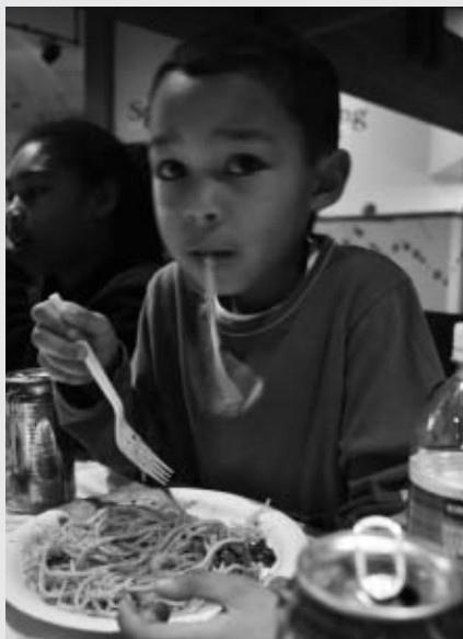
Youth Spaghetti Dinner Event