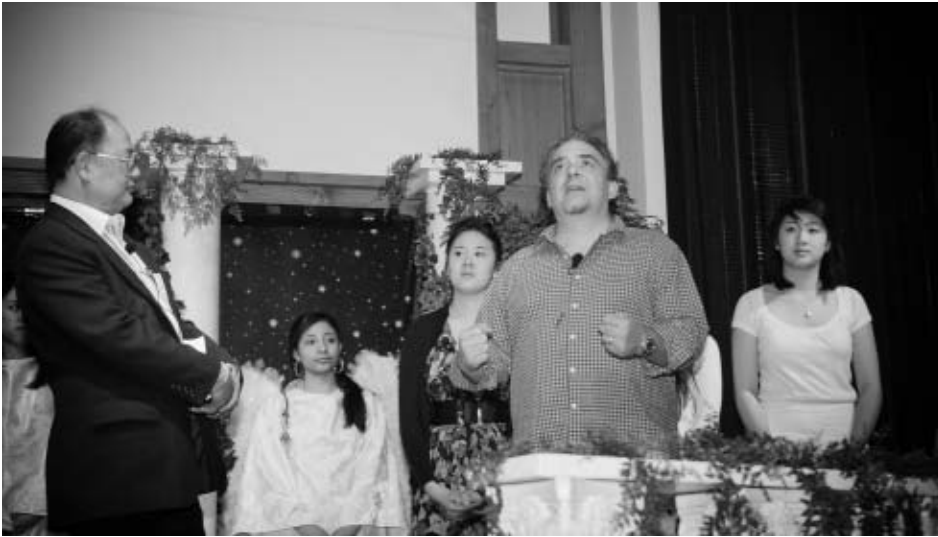
Mercer Island Easter Service