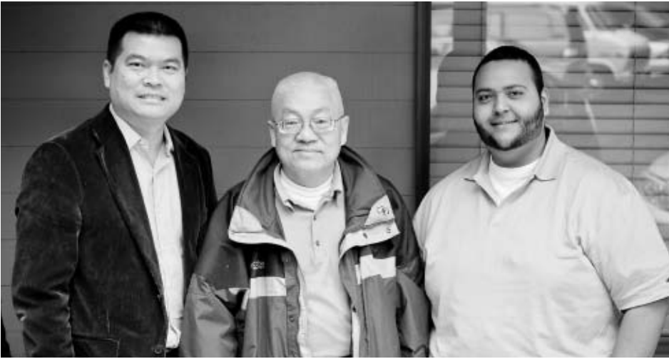
Mercer Island International Service Food Ministry Team