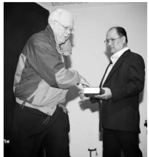
Easter Service at Mercer Island Campus.