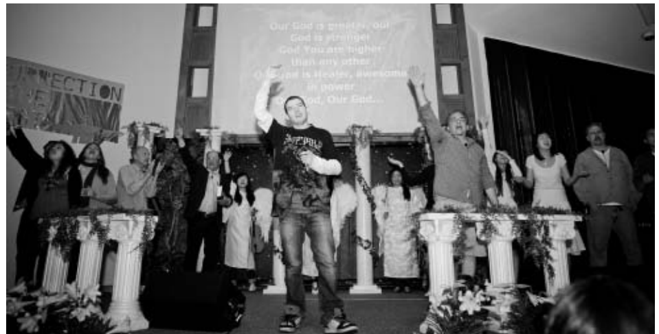
Mercer Island Easter Service