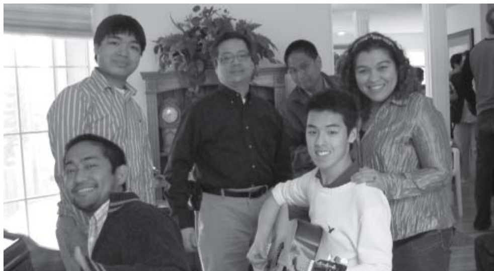
Easter Service at the North Campus

Crosswords Newsletter is a quarterly publication of New Hope International Church. The goals of Crosswords are to communicate the heart of the pastor, the vision and goals of the church, and important church news, testimonies and events in order to create a sense of family and unity amongst the church members. If you would like to receive a copy of Crosswords Newsletter in the mail, please contact the church office at (206) 275-1042.